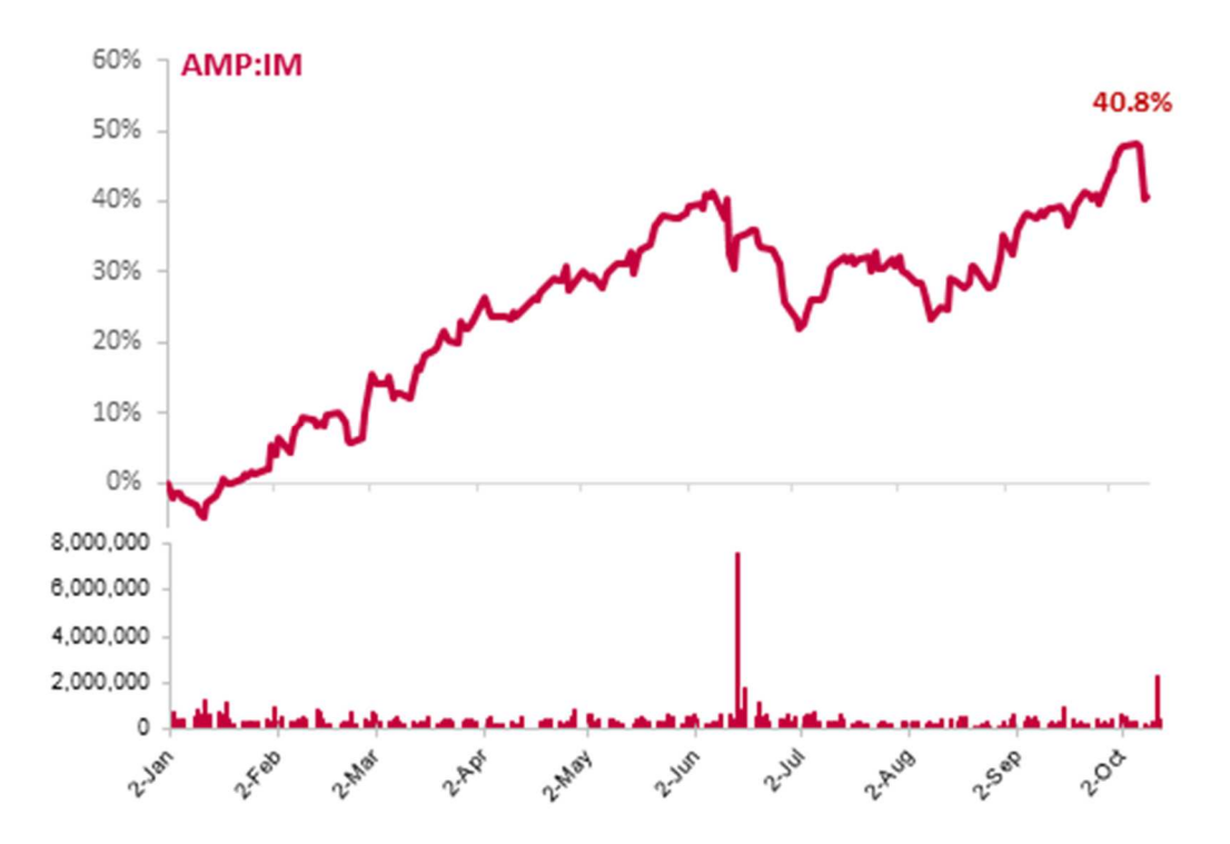
As at 30 September 2017 market capitalisation was €2,910.03 million.

The chart shows the performance of the Amplifon share price and its trading volumes from 2 January 2017 to 13 October 2017.